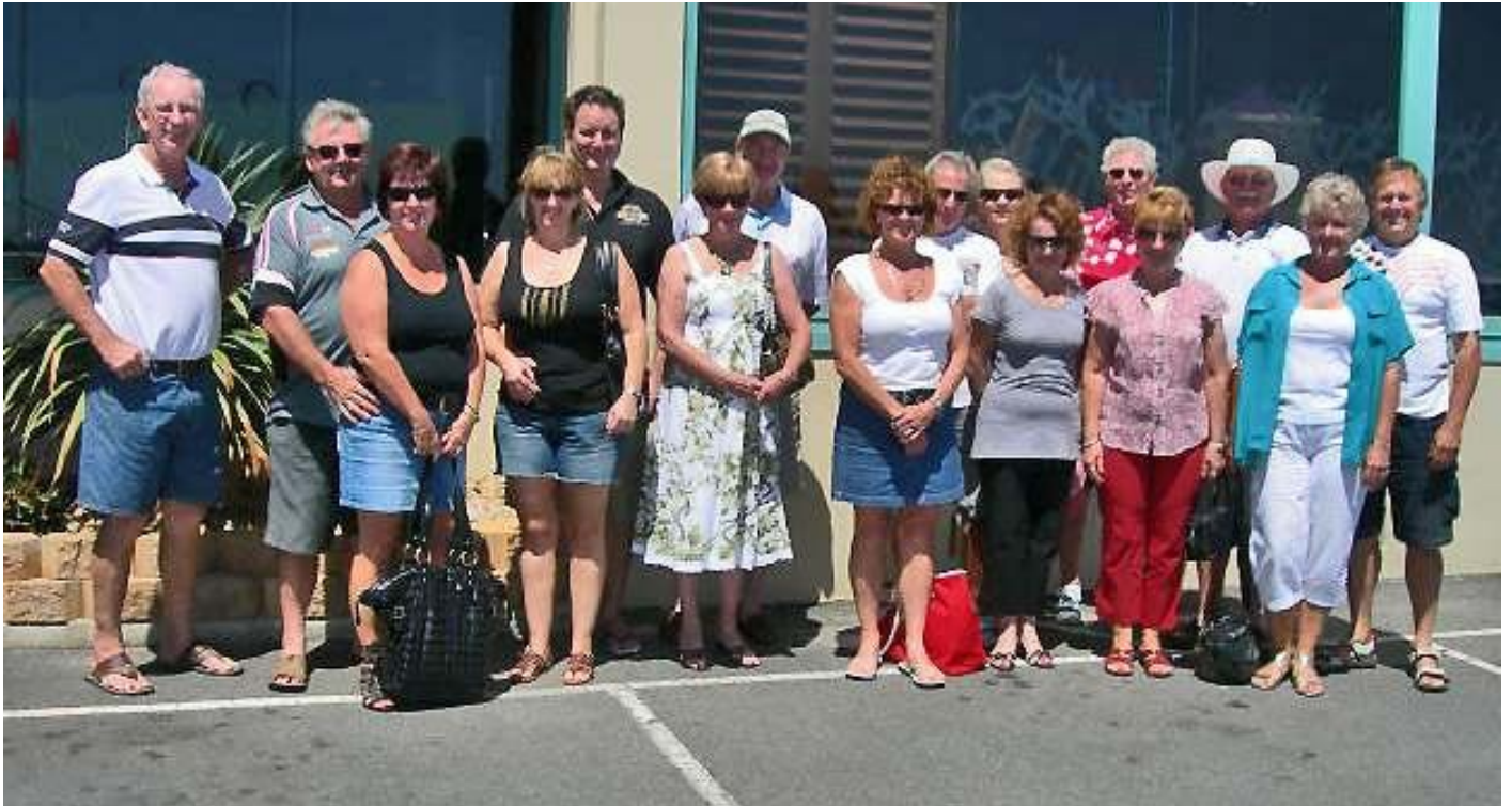
Scarab Breaky Run