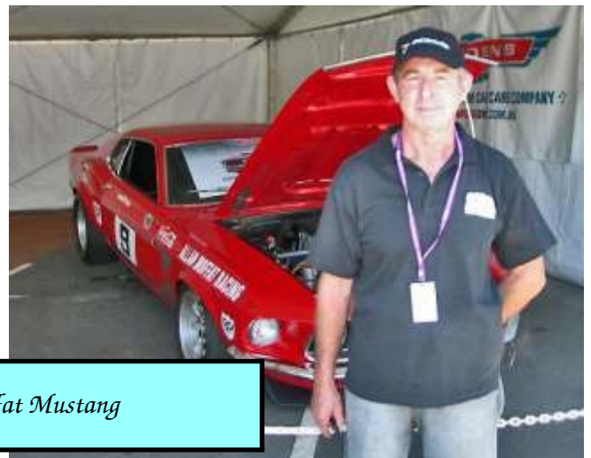
The Mighty Allan Moffat Mustang

Needless to say we enjoyed the day with or without AI GP or Indy Cars and hope that next year will be more